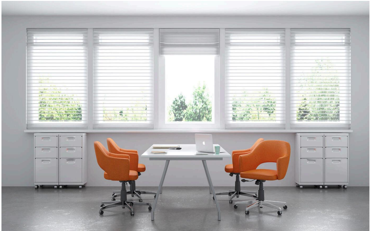
Our products (/seating)