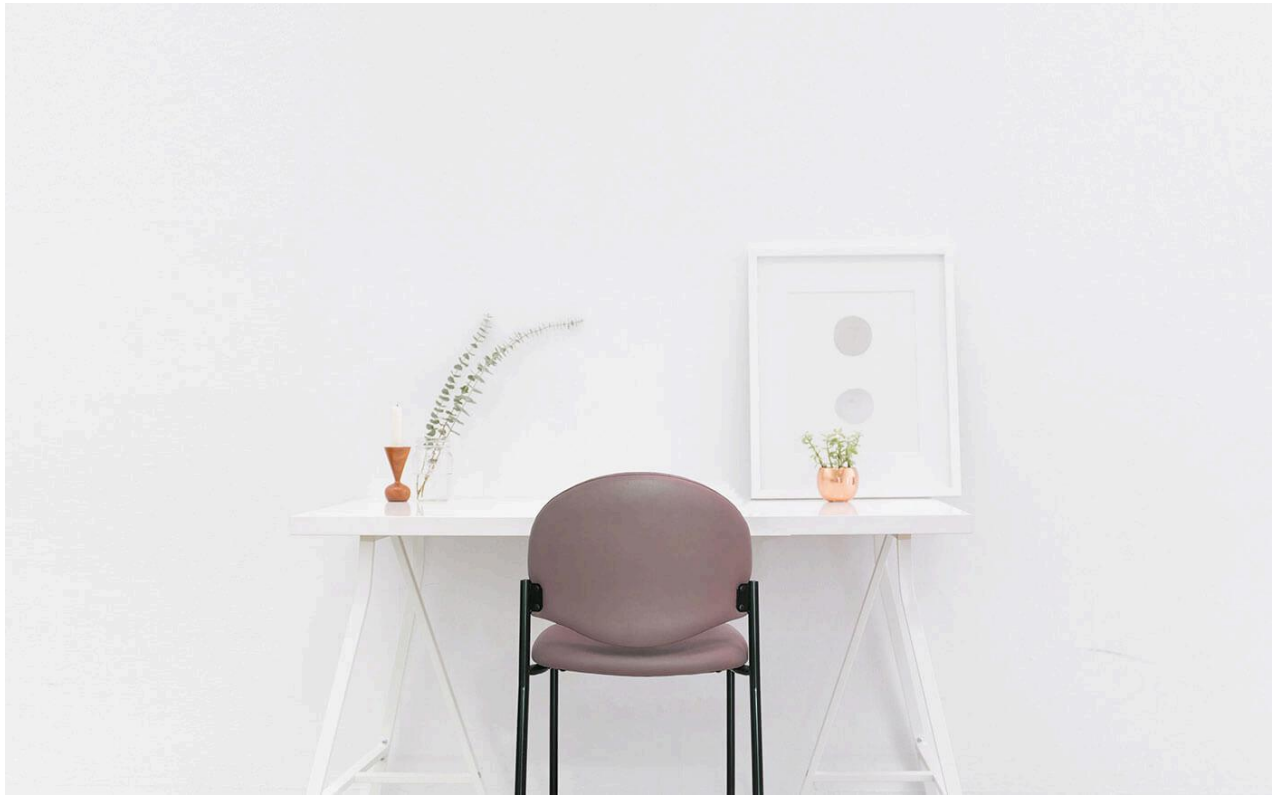
Our careers (/careers)